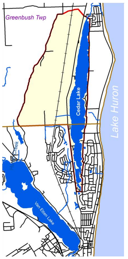
Cedar Lake Watershed (red outline)