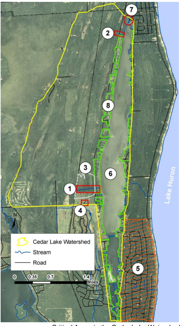
Critical Areas in the Cedar Lake Watershed

Critical areas can range from a severely eroding stream bank that needs to be repaired to a prairie habitat used by an endangered species that needs to be protected.