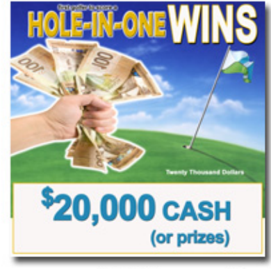
$3.75 per golfer