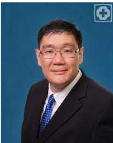
KEE-CHONG NG CHAIR

The ILCOR Pediatrics Life Support Task Force (PLS) addresses pediatric basic & advanced life support issues and special resuscitation situations like septic shock, congenital heart disease, and trauma in pediatrics. Evidence updates, scoping, and systematic reviews on important pediatric resuscitation topics are conducted annually to provide evidence-based and timely updates with treatment recommendations.