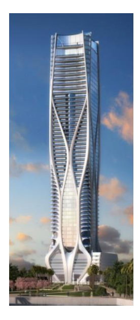
1000 Museum, Miami, FL Architect: Zaha Hadid