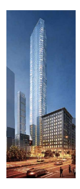
41 East 22<sup>nd</sup> Street, NY Architect: KPF