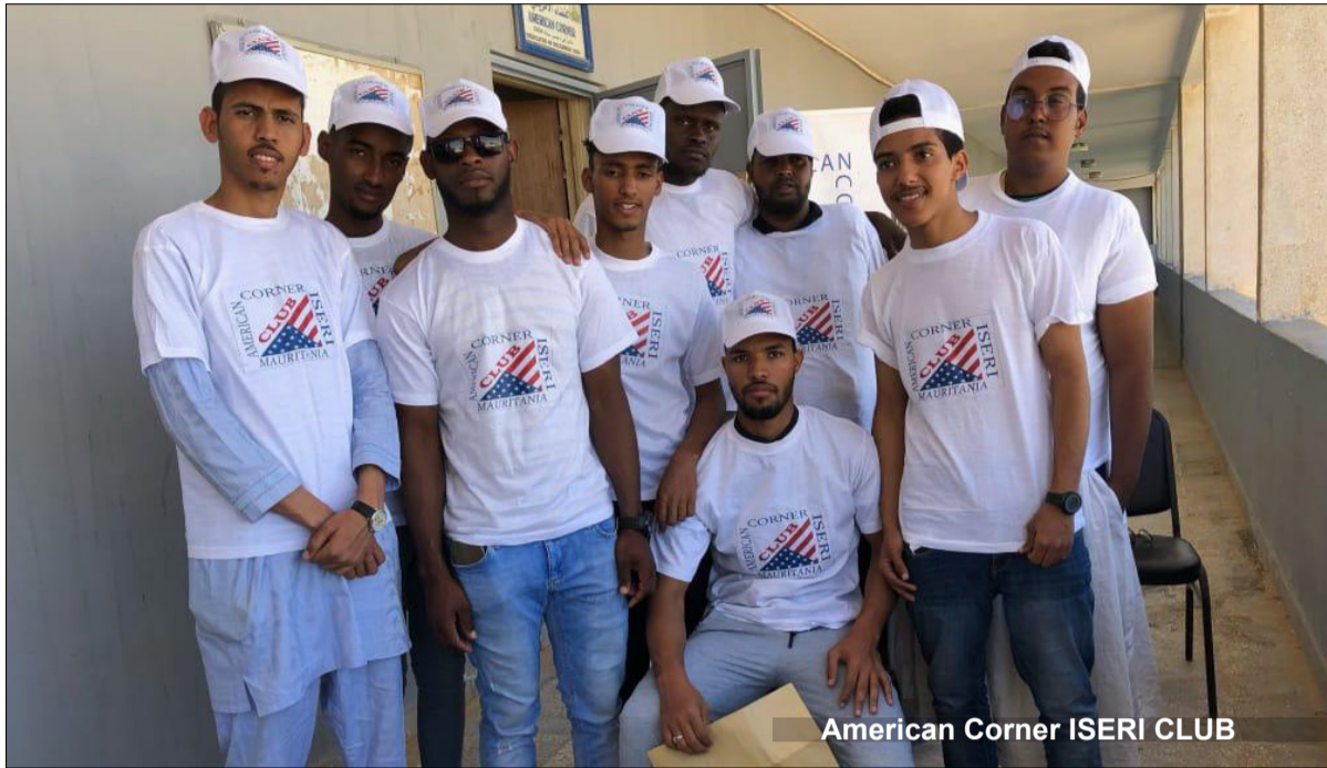
American Corner ISERI CLUB

It's unanimously agreed that English is the lingua franca today. Therefore, it must have influenced so many countries in the world. Mauritania would be one of them. Even though English is neither spoken here as a first language nor as a second one, it is studied at the University of Nouakchott AL Aasriya as a Major field of studies. Some students would graduate with the ability to speak this foreign language though they lack an environment where they can practice it more. Students would be taught all of the necessary skills that one would need to learn any language. Professors would do all their best to fulfill their res-