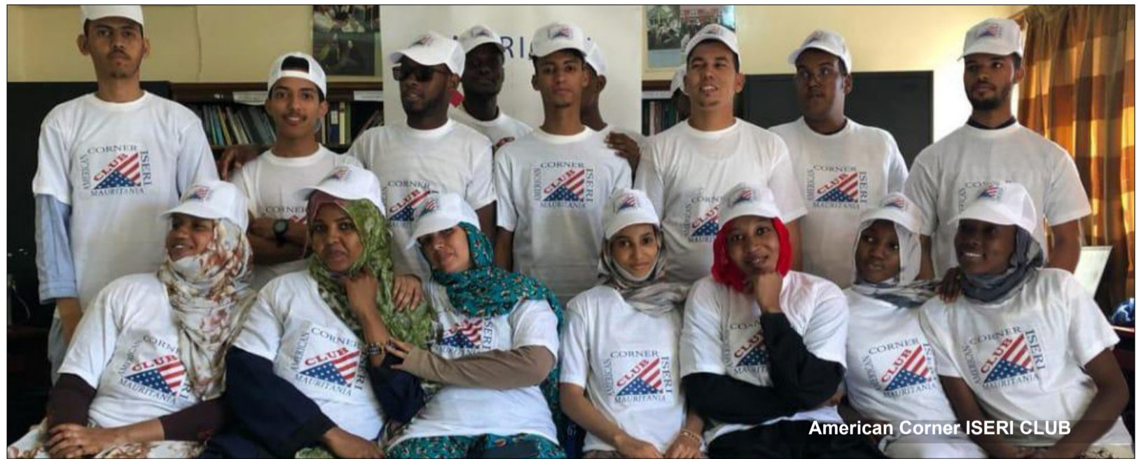
American Corner ISERI CLUB

To sum up, this Newspaper was created to stand up with all of the English speakers whether they are from within or from without.