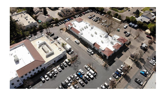
Anticipated opening date for the new building: Summer 2019.