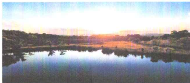
Route 381 N - PO Box 44, Ohiopyle, PA 15470-0044