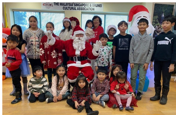
Christmas Party, held at the clubhouse on December 14, 2024.