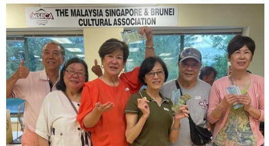
Above photos; Charming faces of June 29th potluck at the clubhouse.