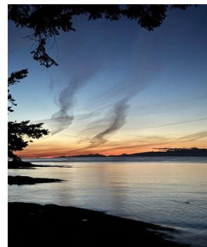
A beautiful sunset in Mayne Island.