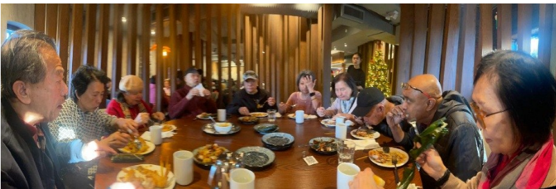
bove photo: Directors and spouses were invited to the ft opening of the new 'John 3:16' restaurant located at 152 Kingsway Ave, in Burnaby.