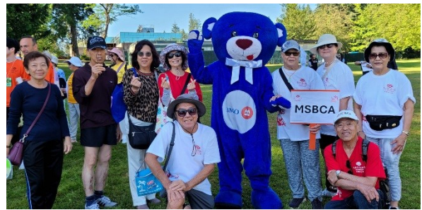
S.U.C.C.E.S.S. Walk With The Dragon, July 15, 2024: The MSBCA participates annually in Stanley Park.