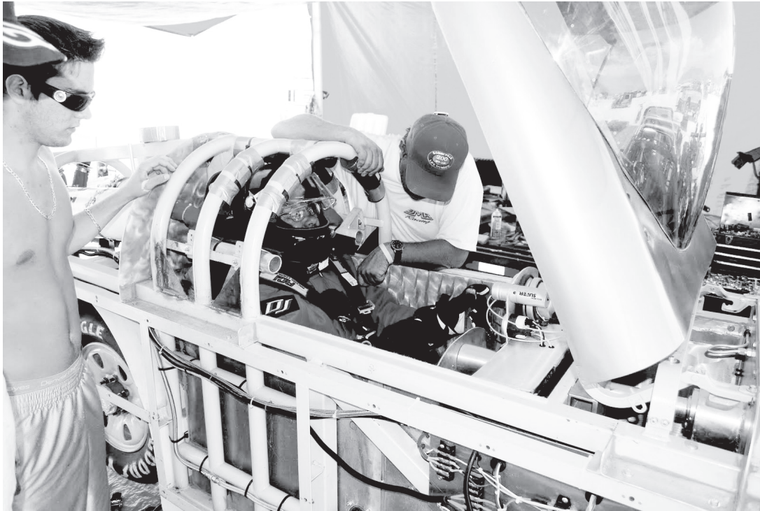
New driver going through a bailout drill