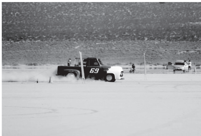
Various vehicles going through the finish line / timing lights