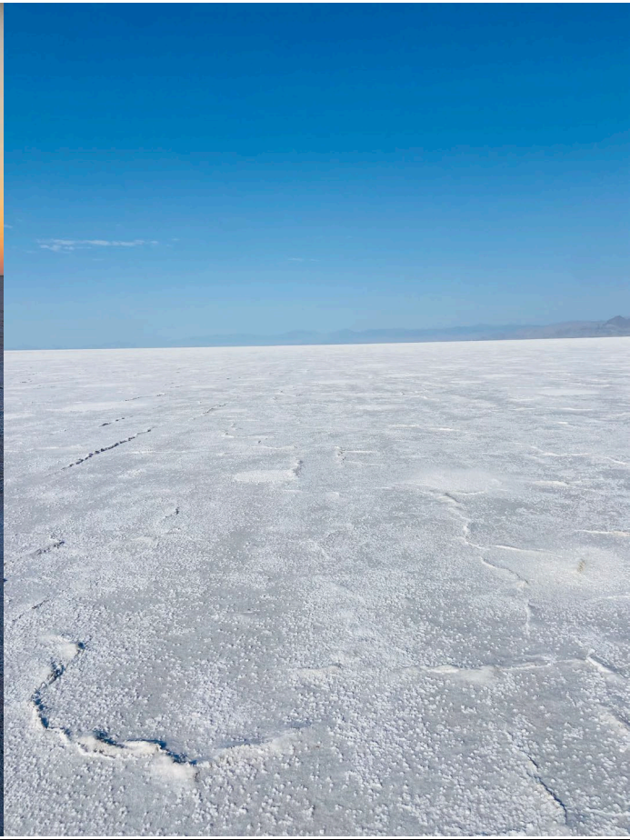
8-Mile on Course #1