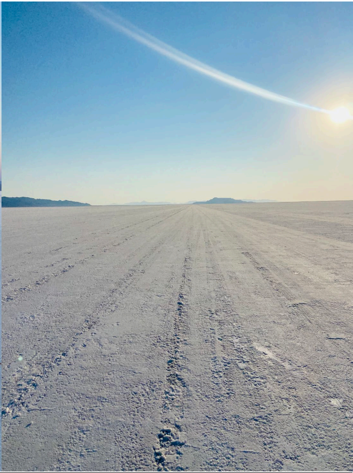
8-Mile Course #1