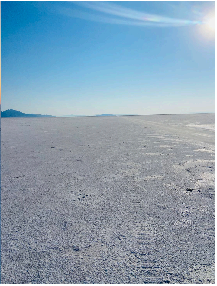
8-Mile Course #1