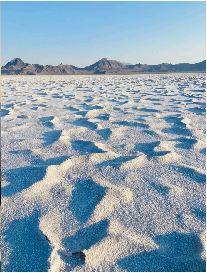
Both Pics are Next to Highway at -1 1/2 Miles (Behind Course #1 Start Line)