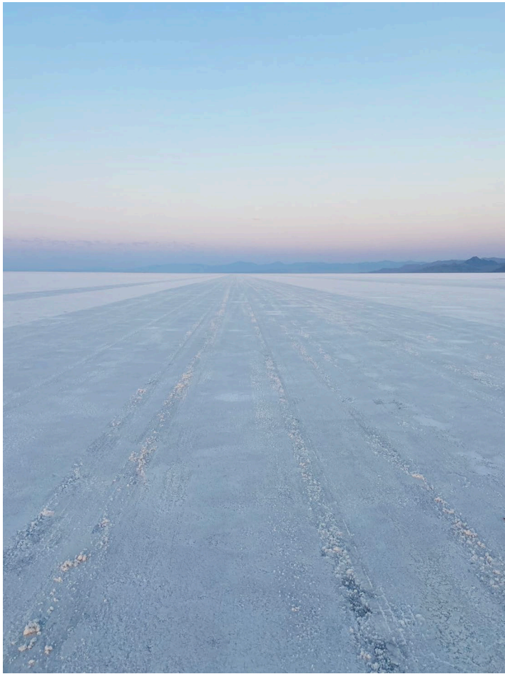
8-Mile Course #2 Looking to Start Line