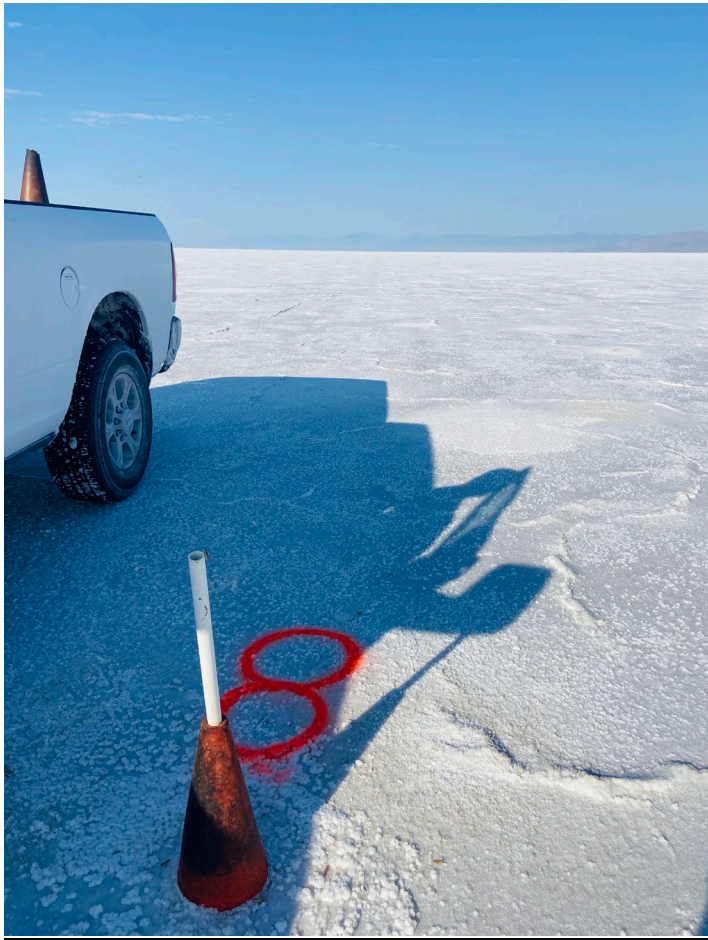
8-Mile Course #2 Looking To Start Line