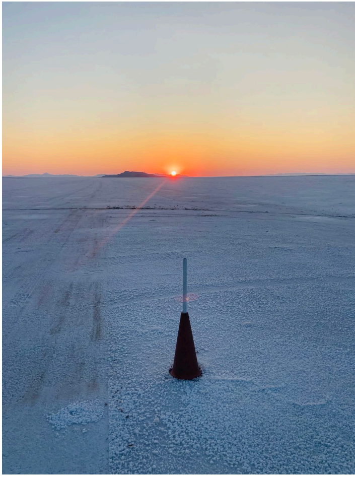
8-Mile Course #1