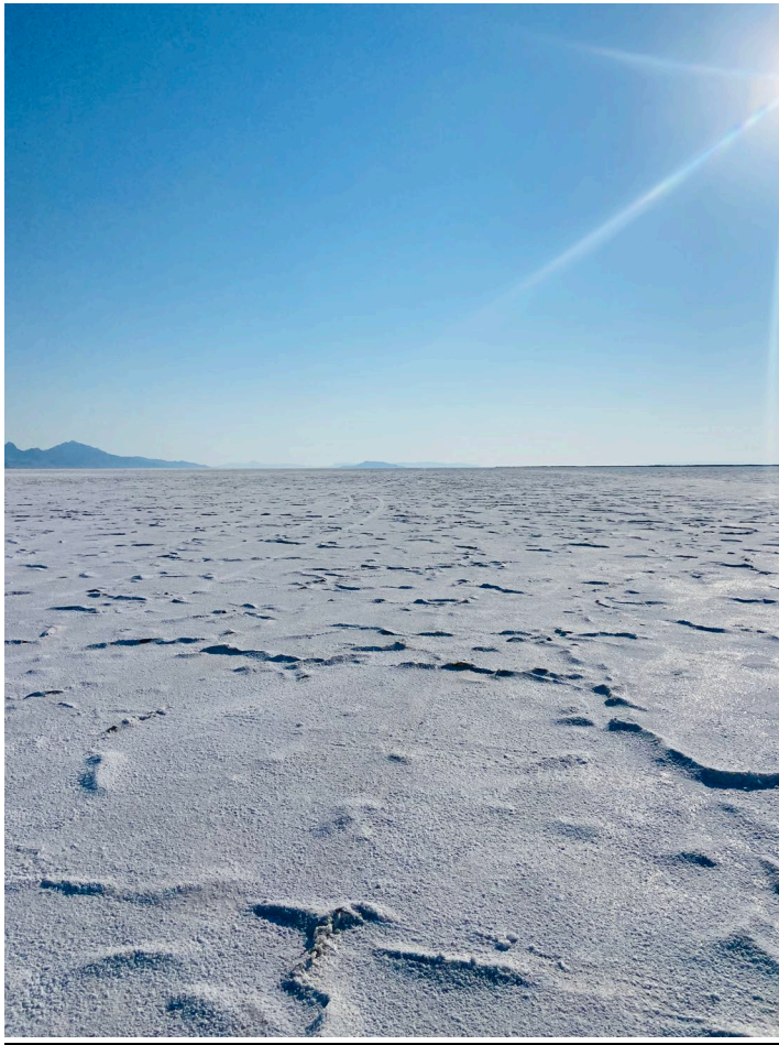
Course #2 Looking Down Course