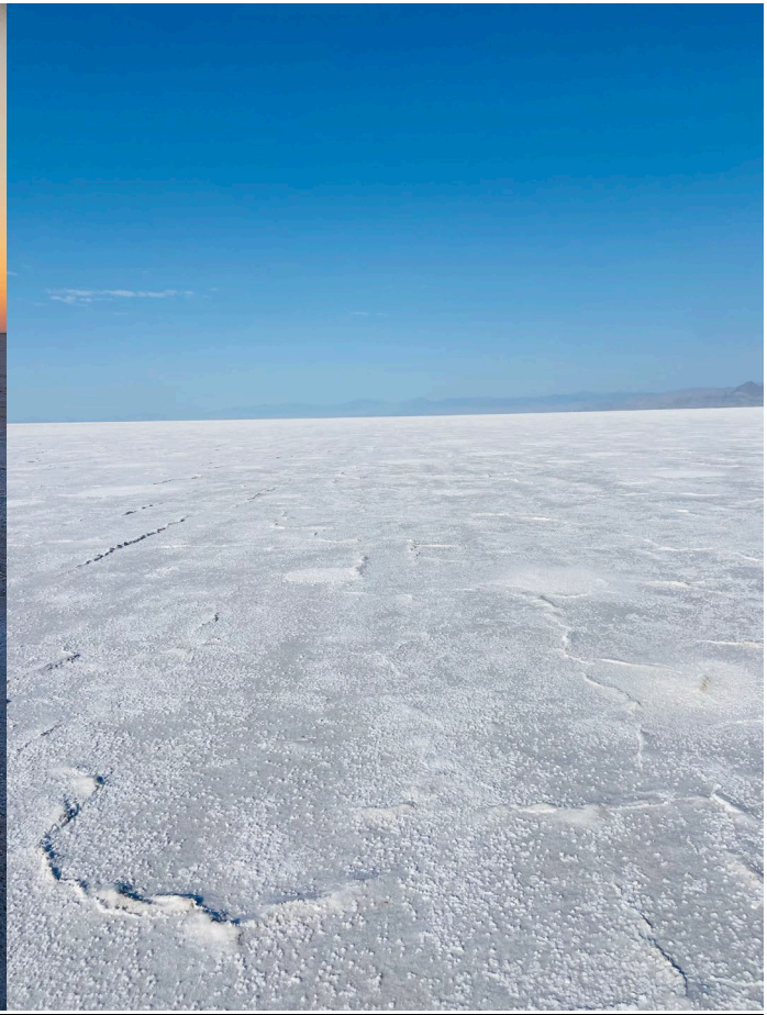
8-Mile on Course #1