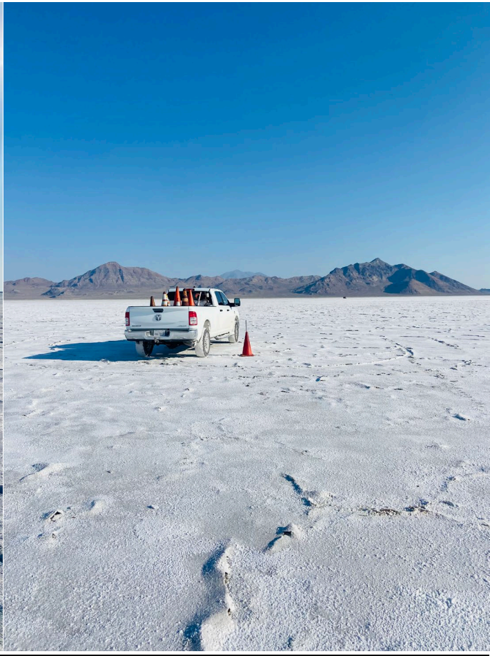
Start Line Course #2