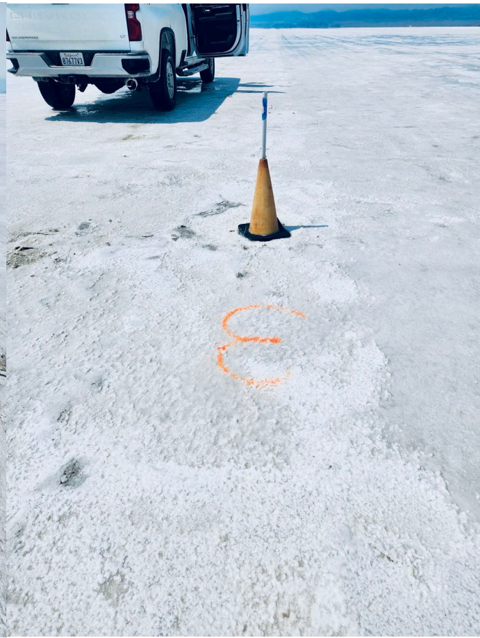
COURSE #1 – MILE #3