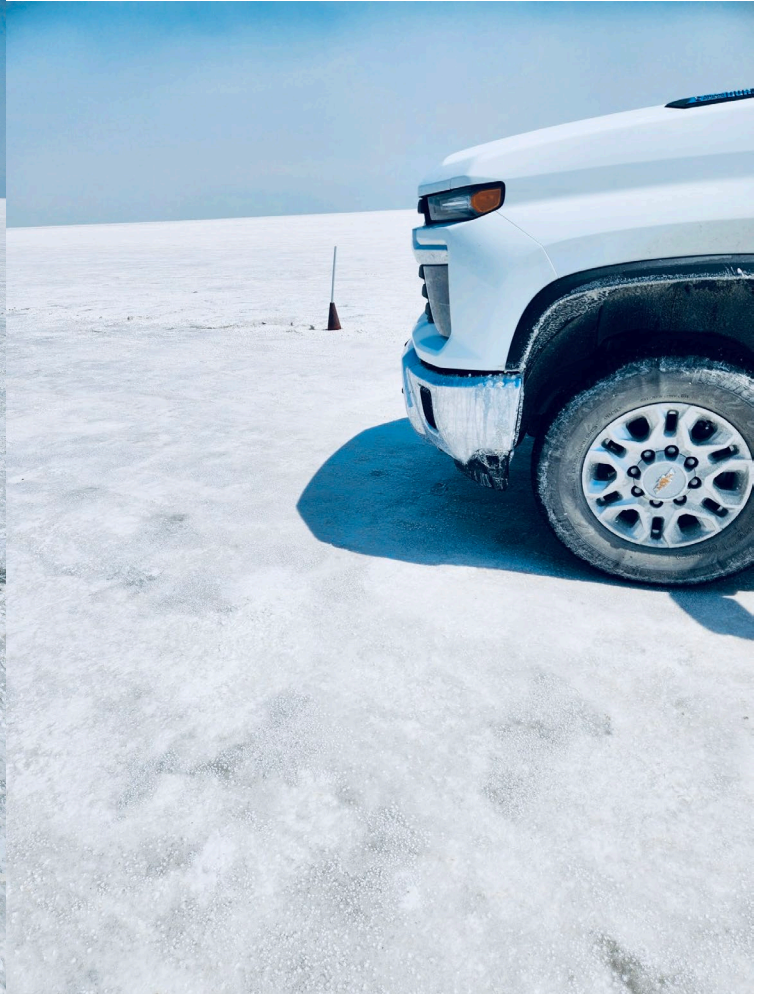
COURSE #1 – MILE #4