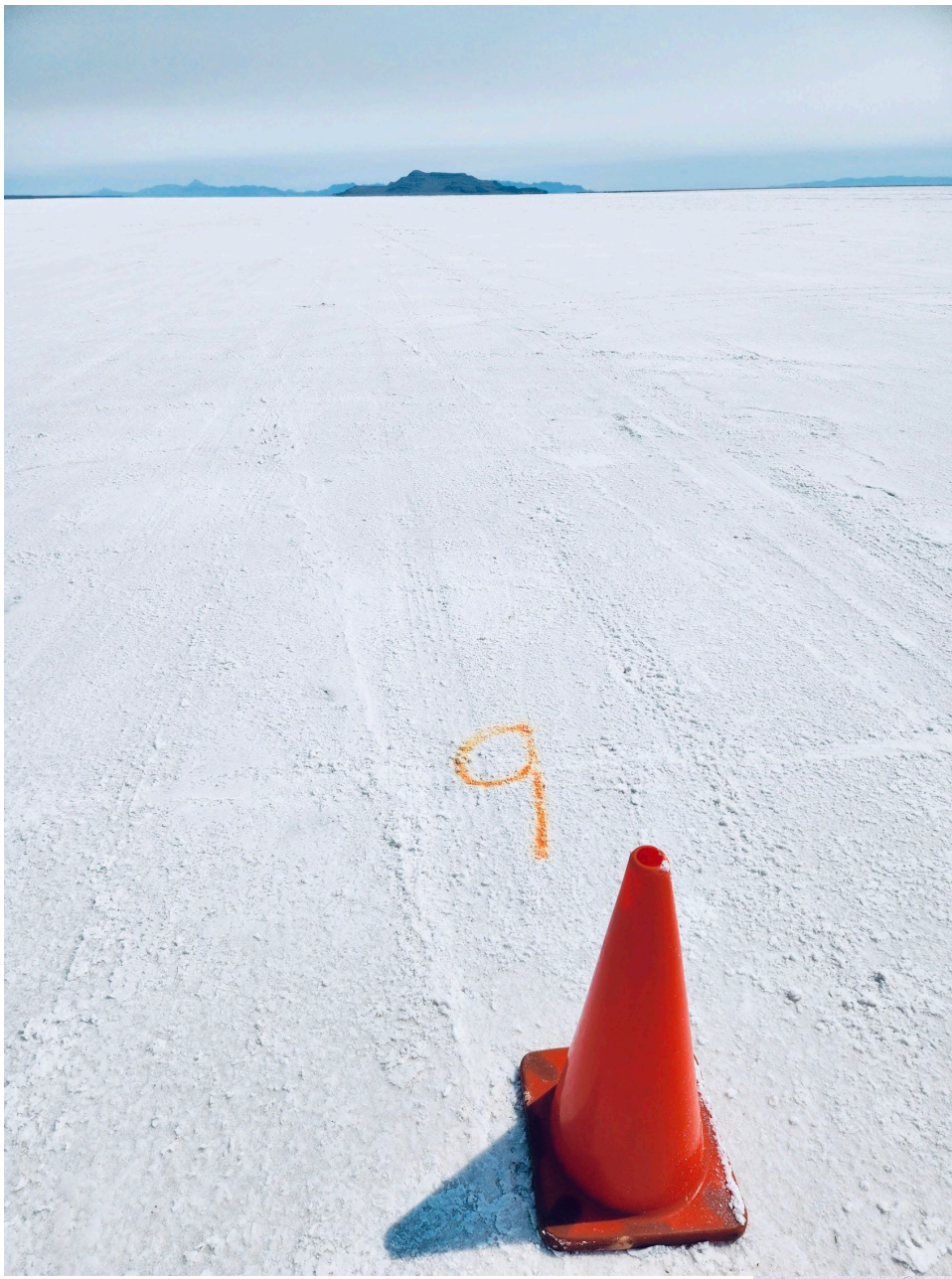
COURSE #1 - MILE #9