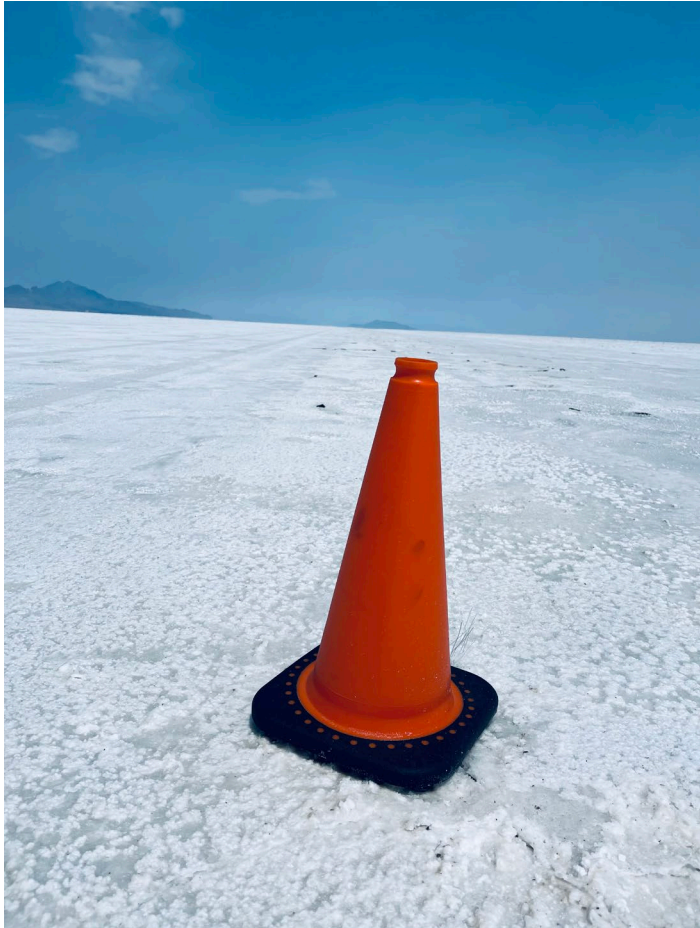
COURSE #1 – MILE #2