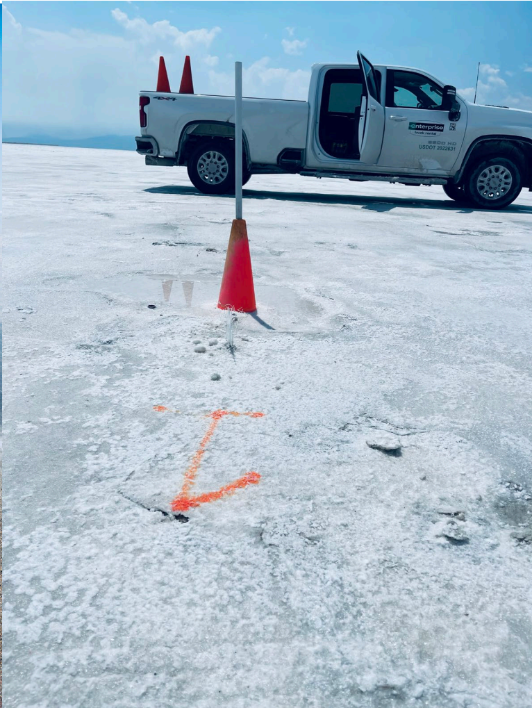
COURSE #1 – MILE #1