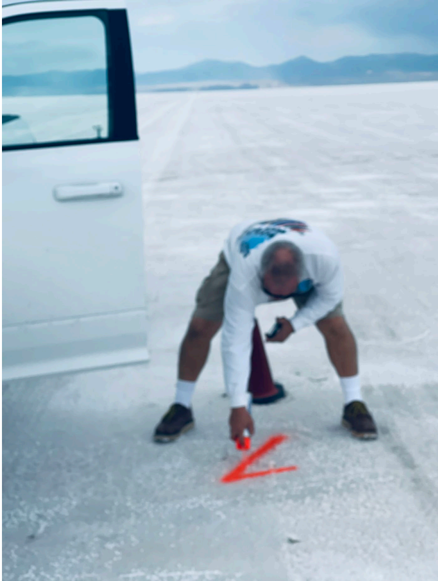
COURSE #1 – MILE #6 & #7