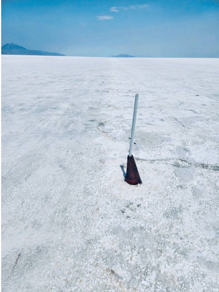
COURSE #1 – MILE #4