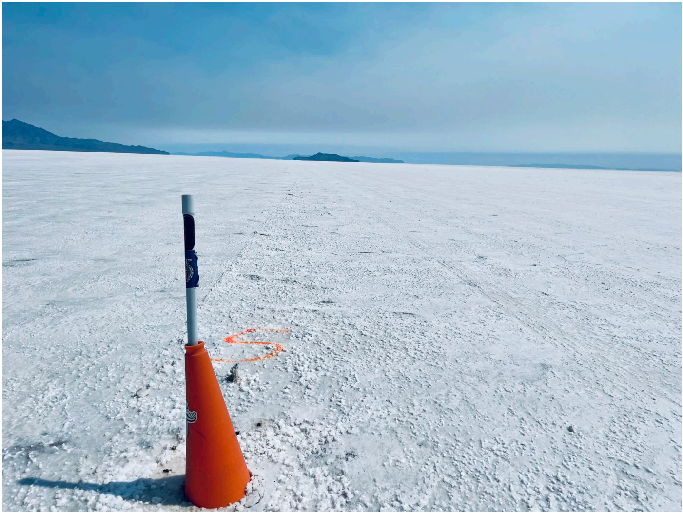
COURSE #1 – MILE #5