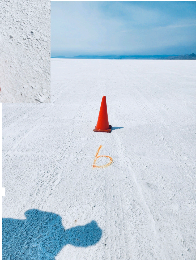
COURSE #1 - MILE #9