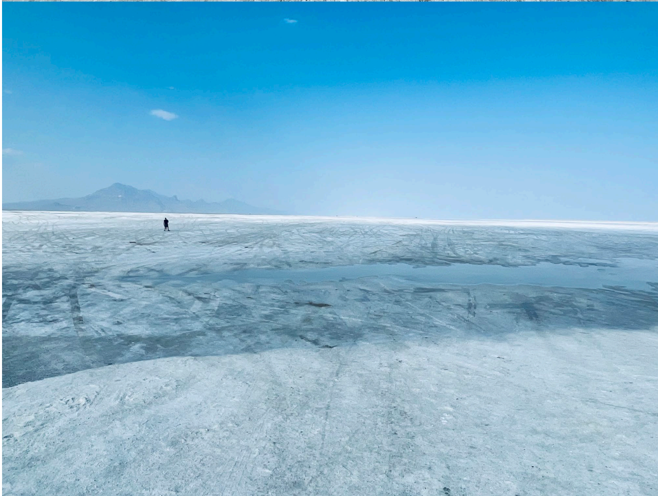
END OF ROAD