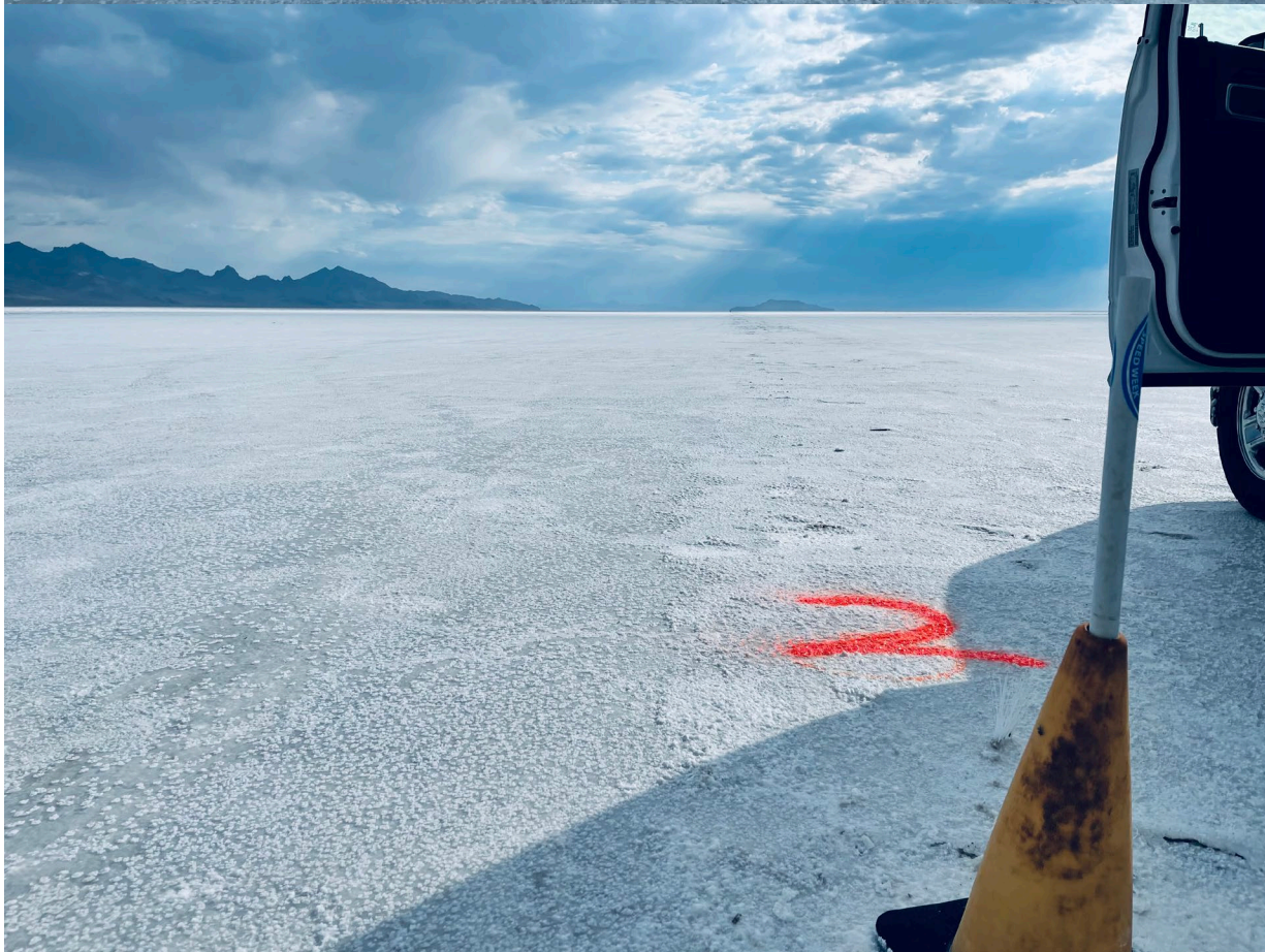
COURSE #1 – MILE #1 & #2