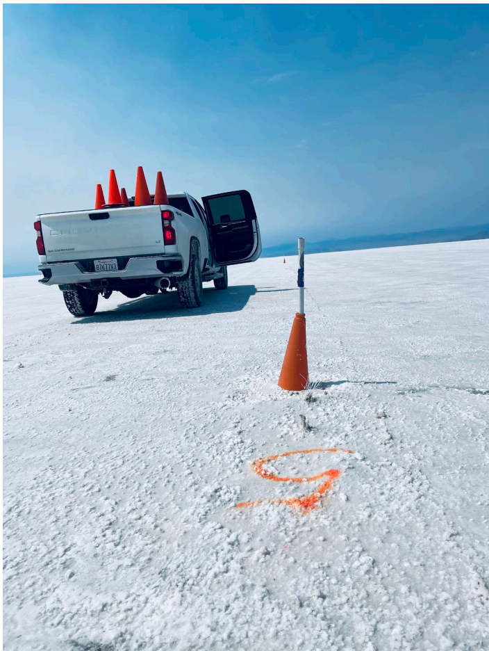
COURSE #1 – MILE #5