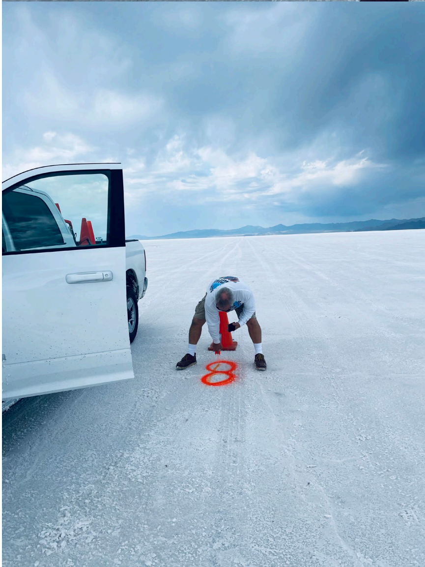
COURSE #1 – MILE #7 & #8