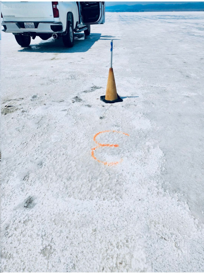
COURSE #1 – MILE #3