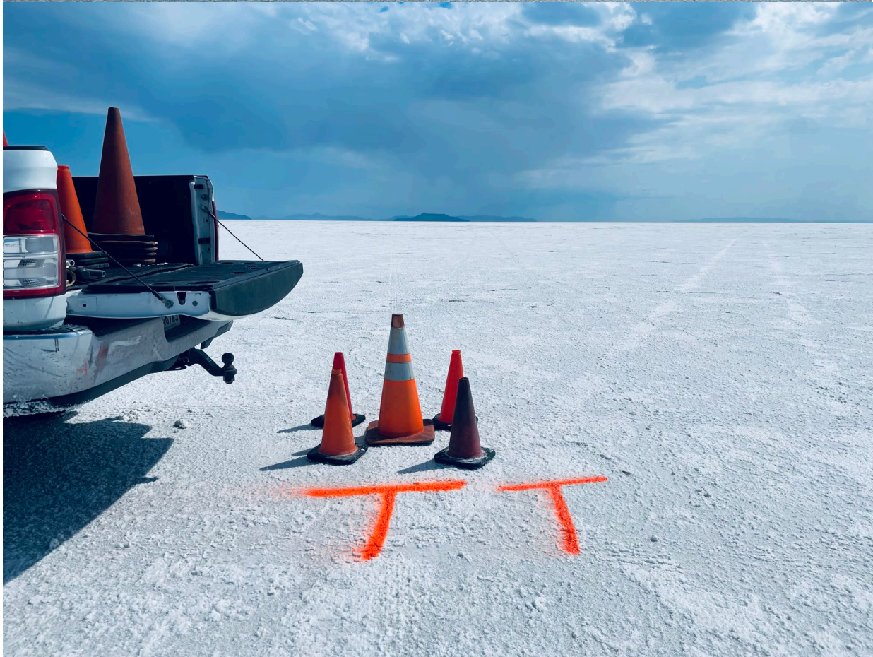
COURSE #1 – MILE #9 & TIMING TOWER