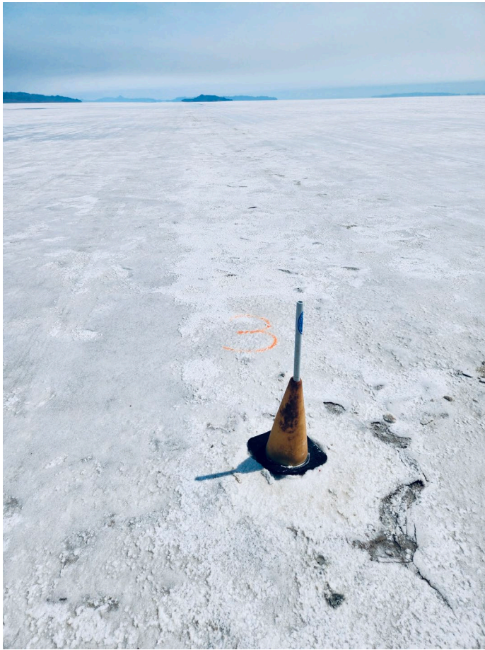
COURSE #1 – MILE #3