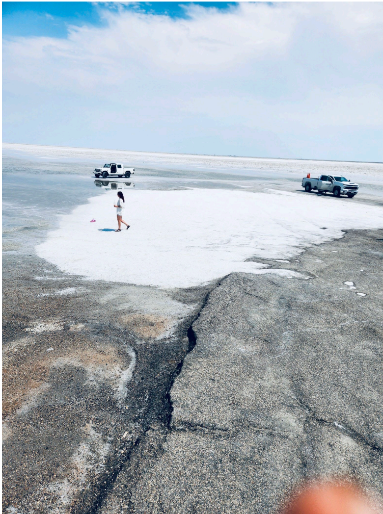
END OF THE ROAD