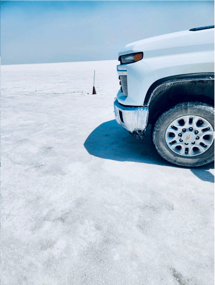
COURSE #1 – MILE #4