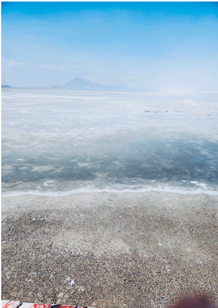
END OF THE ROAD