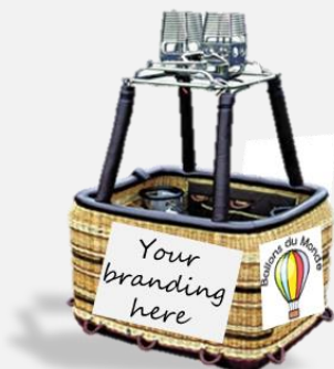
Branding the Basket for Close-up Photoshoots

Ballons du Monde can be customised to your objectives. We offer options to brand the basket, create a custom balloon banner or build an entire balloon envelope.