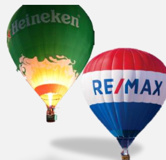
Custom-built Balloon Envelope for Maximum Impact