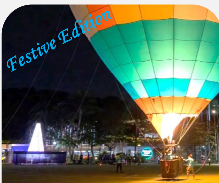
Evening session on Sentosa island to usher in the year-end holiday season