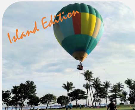
Sunrise session along the coastline on Sentosa Island

Ballons du Monde is Singapore's first hot air balloon operator and regional balloon advertising platform. We offer brands a unique advertising platform and visitors a novel flight experience. Unlike traditional countryside balloon flights, we operate sunrise and night tethered ballooning sessions at high visibility sites in the heart of the city and along coastlines.