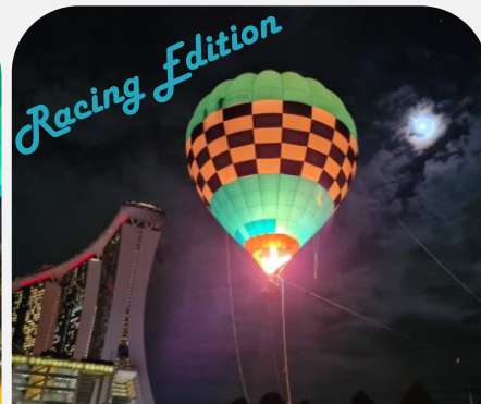
Evening session at the Marina Bay to celebrate the return of the Singapore F1 Grand Prix in 2022