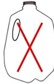
Typically containers with a handle, including gallon jugs