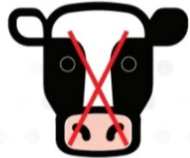
Beverages with milk listed as the first ingredient