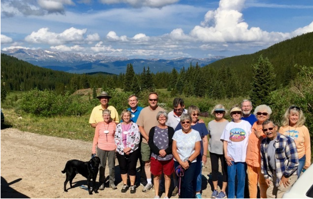
Below: Mosquito pass in the background and to the left.