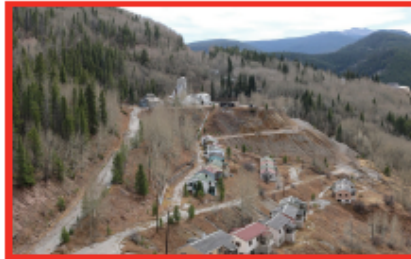
Gilman (above) is closed to foot traffic as it is built above dangerous cliffs. Red Cliff is before Gilman and is a fun town to explore/visit....neat "bridge" on highway 24, at Red Cliff.

Google "Leadville" and surroundings! Look up all or part of the Leadville activities, scenic drives, museums, walking and 4x4-trails, ghost towns, restaurants, etc. — in the area — BEFORE you arrive in Leadville. Questions? Call Don at 303-232-0859 (land line) or 303-882-7538.