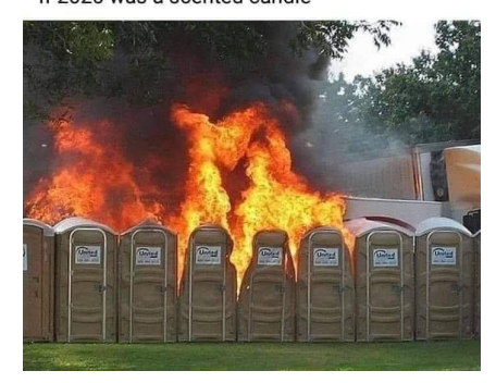
If 2020 was a scented candle

July. Basically, the cancellations were due to the COVID virus, except for the Glenwood Springs Rally which was cancelled two days prior due to the severe fires in the immediate area.