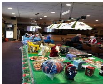
Dec. 24 th Prizes