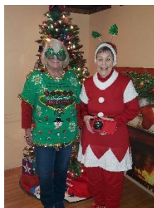
Ugly Sweater Party