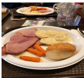
Dec. 24 th Dinner

P.S. The extra treat bags were taken to the Union Gospel mission for them to give to the children.