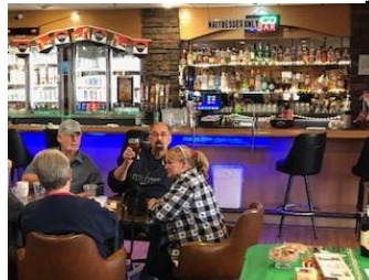
Enjoying your club