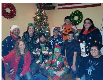
Ugly Sweater Party