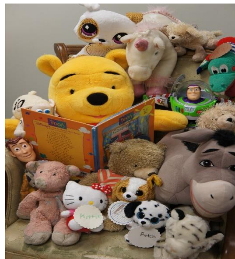
Stuffed Animal Drive during Monday Night Bingo November and December.

Sep. 6 th 2 of Diamonds, $15.00; Sep. 13 th K of Diamonds, 10.00; Sep. 20 th 2 of Hearts, $15.00; Sep. 27 th 6 of Hearts, $5.00; Oct. 4 th Joker, $50.00; Oct. 11 th 7 of Hearts $5.00 & Oct. 18 th 3 of Clubs $10:00.