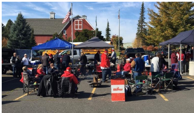
Tailgate Party at Eastern.