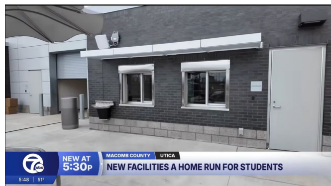
Left: UCS district officials join Stevenson administrators, coaches and players to cut the ribbon on the new Stevenson Athletic Complex on April 6. Right: The Stevenson Athletic Boosters will operate a second outdoor concession stand at the new complex.