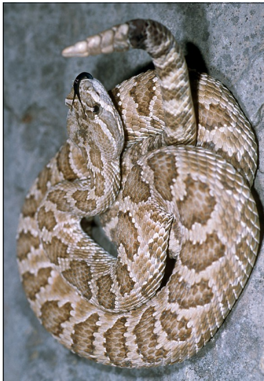
Great Basin Rattlesnake