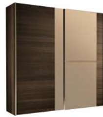
2/D SLIDING WARDROBE (with central mirrors) PJAC0020

in ecoleather inch W 63" D 22" H 18" cm L 160 P 55 H 45 Crts 2 kg 47 m 3 0,32