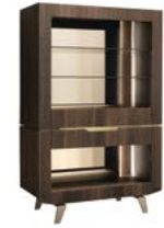
OPEN CABINET PJAC0600RT With 2 drawers inch W 47" D 22" H 74" cm L 120 P 55,1 H 187,3 Crts 3 kg 172 m 3 1,57