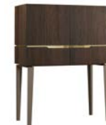
COCKTAIL CABINET PJAC0615RT With 2 doors and pull out shelf inch W 51" D 22" H 67" cm L 130 P 55 H 170 Crts 2 kg 127 m 3 0,83