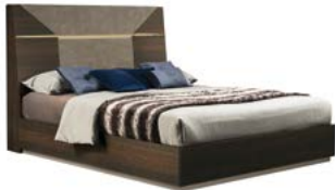
Q.S./UK 5" BED PJAC0150RT (UK FIRE RETARDANT) PJAC0150RTI

With termocotto oak structure, seat and back in same ecoleather as headboard inch W 20" D 24" H 42" cm L 50 P 61 H 107 Crts 1 kg 11 m 3 0,35