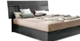
Q.S./UK 5" BED PJMN0150

inch W 41" D 1" H 35" cm L 104 P 2,2 H 89,9 Crts 1 kg 19 m 3 0,09