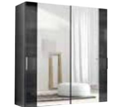
2/D SWINGING WARDROBE

H239 - PJMN0014 inch W 135" D 25" H 94" cm L 341,8 P 63,5 H 239,1 Crts 10 kg 466 m 3 0,72