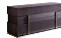
3/DRW. DRESSER KJMN120 With 3 drawers

inch W 64" D 22" H 30" cm L 163,5 P 54,8 H 76,3 Crts 1 kg 102 m 3 0,85