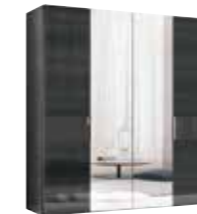
4/D SWINGING WARDROBE

H239 - PJMN0010 inch W 68" D 25" H 94" cm L 172,1 P 63,5 H 239,1 Crts 8 kg 263 m 3 0,43