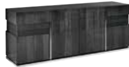
4/D BUFFET PJMN0610/PJMN0611 With 4 doors inch W 83" D 22" H 32" cm L 211,1 P 54,8 H 81,6 to be sold ASSEMBLED PJMN0610 Crts 2 kg 137 m 3 1,29 to be sold NOT ASSEMBLED PJMN0611 Crts 4 kg 128 m 3 0,49