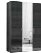
3/D SWINGING WARDROBE

inch W 90" D 87" H 49" cm L 227,5 P 219,8 H 123,8 WITHOUT our orthopedic spring Crts 3 kg 115 m 3 0,36