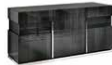
3 DOORS BUFFET PJMN0612 With 3 doors inch W 69" D 22" H 32" cm L 175 P 54,9 H 81,6 Crts 2 kg 119 m 3 1,06