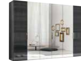
6/D SWINGING WARDROBE

H239 - PJMN0012 inch W 90" D 25" H 94" cm L 228,7 P 63,5 H 239,1 Crts 8 kg 318 m 3 0,51