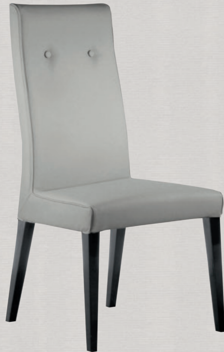
Alternative "Palace" chair available in ecoleather

ALF ITALIA PRESENTS THE MONTECARLO COLLECTION: BOLD YET ELEGANT LINES, THOROUGH YET WELCOMING. A COMPLETE COLLECTION THAT ADDS VALUE TO ANY SETTING, FROM THE DINING ROOM TO THE BEDROOM, MAKING YOUR HOME THE SHOWCASE OF WHAT IS "MADE IN ITALY".