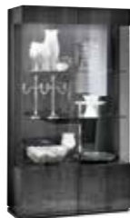
2/D CURIO PJMN0600/PJMN0601 With 2 glass doors inch W 42" D 21" H 75" cm L 105,5 P 52,7 H 190,4 to be sold ASSEMBLED PJMN0600 Crts 2 kg 135 m 3 1,49 to be sold NOT ASSEMBLED PJMN0601 Crts 3 kg 135 m 3 0,45