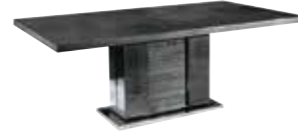
EXTEN. DINING TABLE PJMN0615 With one leaf w 20" cm 50 inch W 63/83" D 37" H 30" cm L 160/210 P 95 H 76,5 Crts 2 kg 111 m 3 0,6