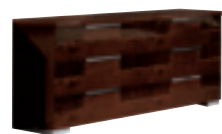
6/DRW. DRESSER KJP1120CN With 6 drawers

inch W 69" D 20" H 32" cm L 174 P 51 H 81,6 Crts 1 kg 97 m 3 0,91