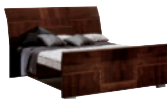
Q.S./UK 5" BED PJPI0150CN Inner size inch 61 1/2" x 81 1/2" cm 157 x 207

inch W 45" D 1" H 42" cm L 114 P 2,8 H 106,2 Crts 1 kg 28 m 3 0,09