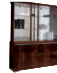
USA 4/D CHINA CABINET (110V) PJPI0600CN UK 4/D CHINA CABINET (220V) PJPI0601CN With 2 glass shelves, 2 wood shelves, 2 lights and cutlery drawer inch W 66" D 22" H 82" cm L 167 P 55 H 209 Crts 3 kg 194 m 3 2,04