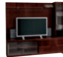
ENTERT. CENTER PJPI0633CN With 2 doors sliding base, 1 door column, shelves inch W 73" D 21" H 70" cm L 185 P 54 H 177 Crts 3 kg 168 m 3 0,99