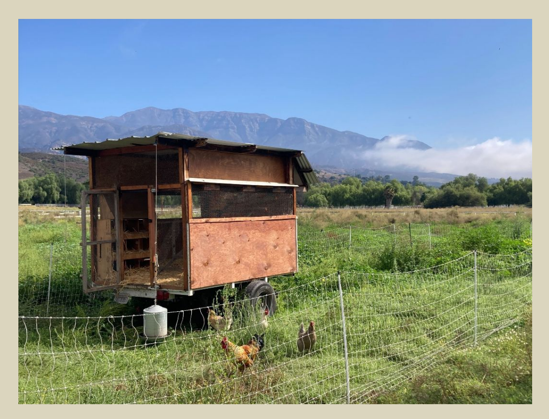
Chickens enjoy a diverse salad from their mobile coop in our upper pasture.

If you're new to our work, sign up for our newsletter <u>here</u> to stay up to date on our land tending and various offerings.