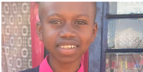
Kenya DOB: 07/27/2008