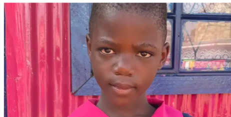
Kenya DOB: 12/27/2012