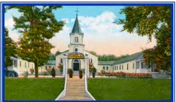
A postcard depicting the first Franciscan monastery in Lemont.