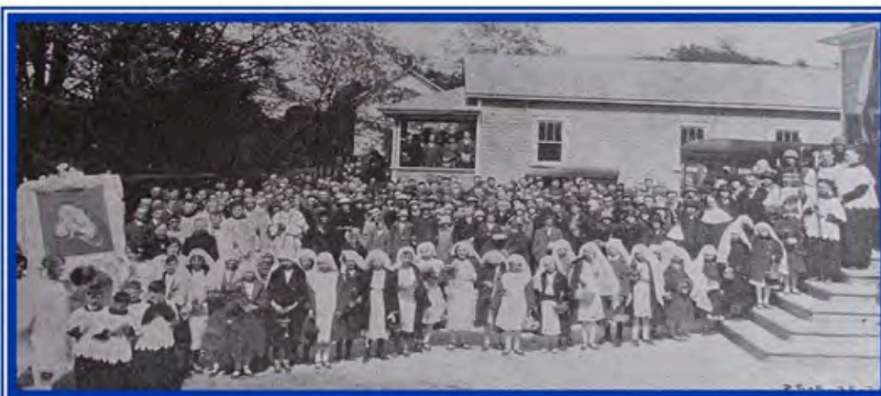
First Slovenian pilgrims to Mary Help of Christians in Lemont on May 24, 1925