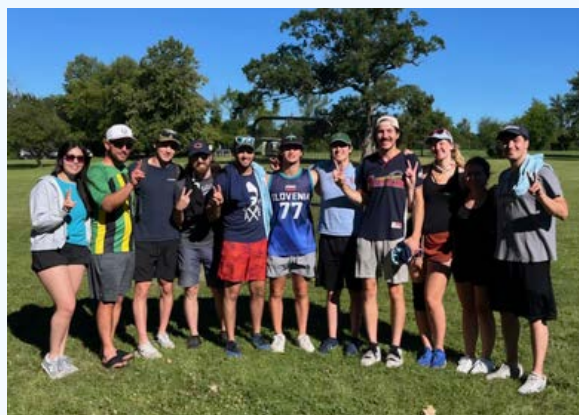
2024 SSK Softball 2nd Place: Team Charlie Buh