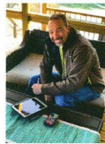
Inspections By Rob

Home Inspections Residential or Commercial. With more than 20 years of construction experience I hope to give you an in depth and complete inspection of your home or property. Call me today to set up an appointment that will hopefully fit your schedule. Then just go online and fill out the inspection request by visiting inspectionsbyrob.com .