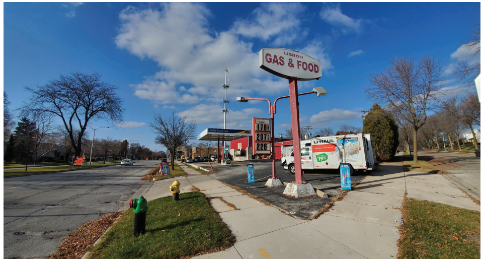
Lisbon Gas & Food at the Intersection of North 87th Street and West Lisbon Avenue