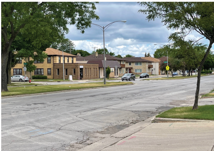
Intersection of North 91st Street and West Lisbon Avenue