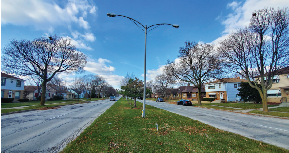
West Lisbon Avenue