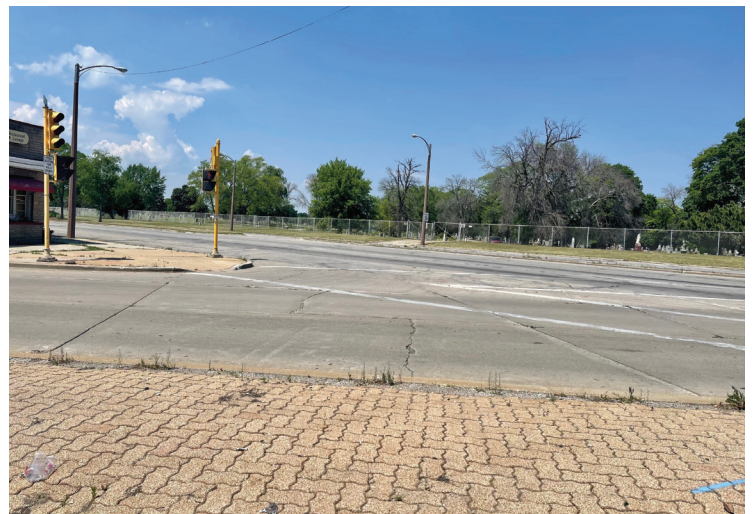
Holy Cross Cemetery at the Intersection of West Burleigh Street and West Lisbon Avenue