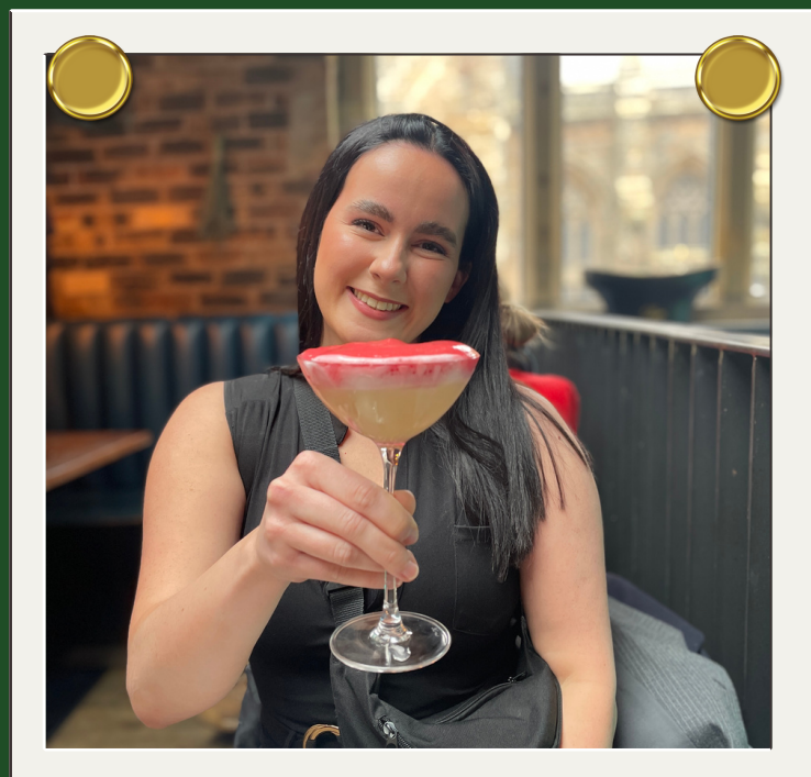
CONTACT FOR A QUOTE TODAY!