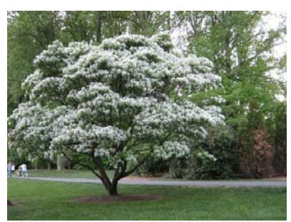
Chinese Fringe Tree