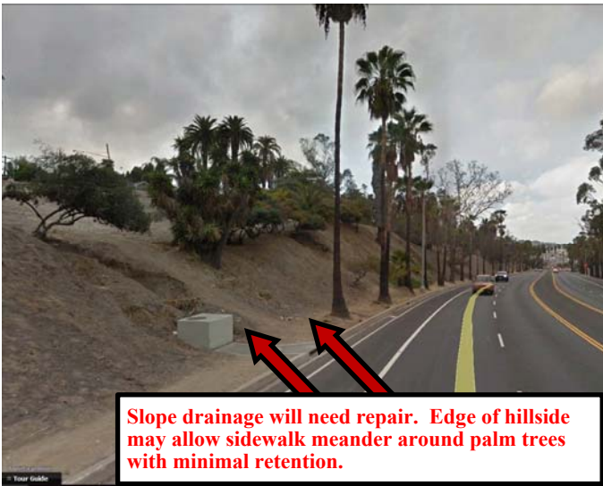
Slope drainage will need repair. Edge of hillside may allow sidewalk meander around palm trees with minimal retention.