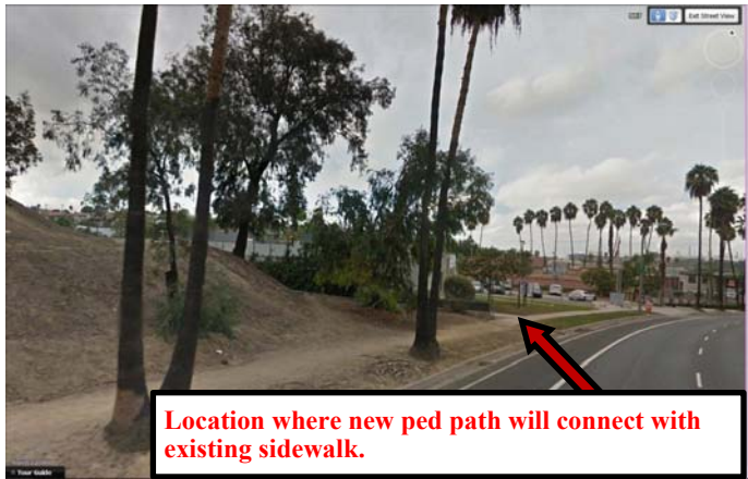
Location where new ped path will connect with existing sidewalk.