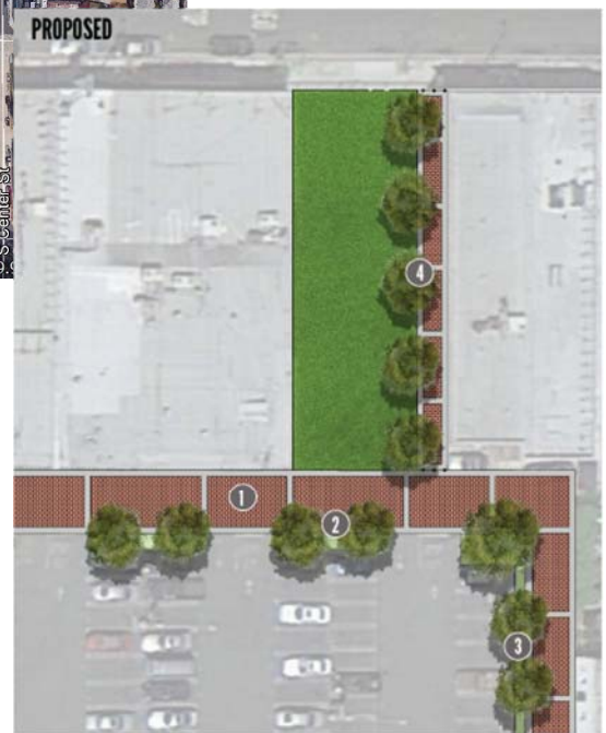
THIS GRAPHIC IS NOT SITE SPECIFIC AND IS INTENDED TO REFLECT THE FULL RANGE OF POTENTIAL IMPROVEMENTS.