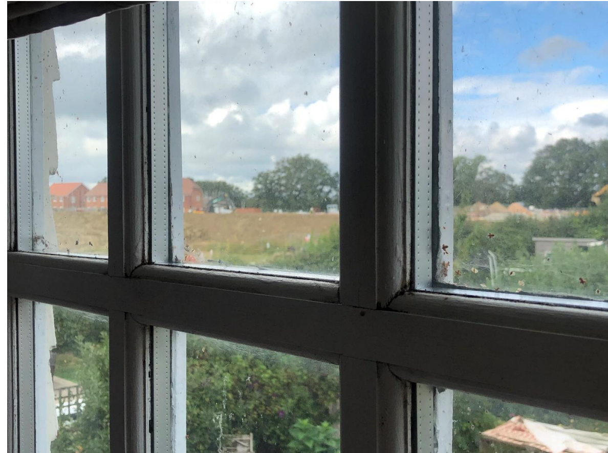
View from bedroom window summer 2021.