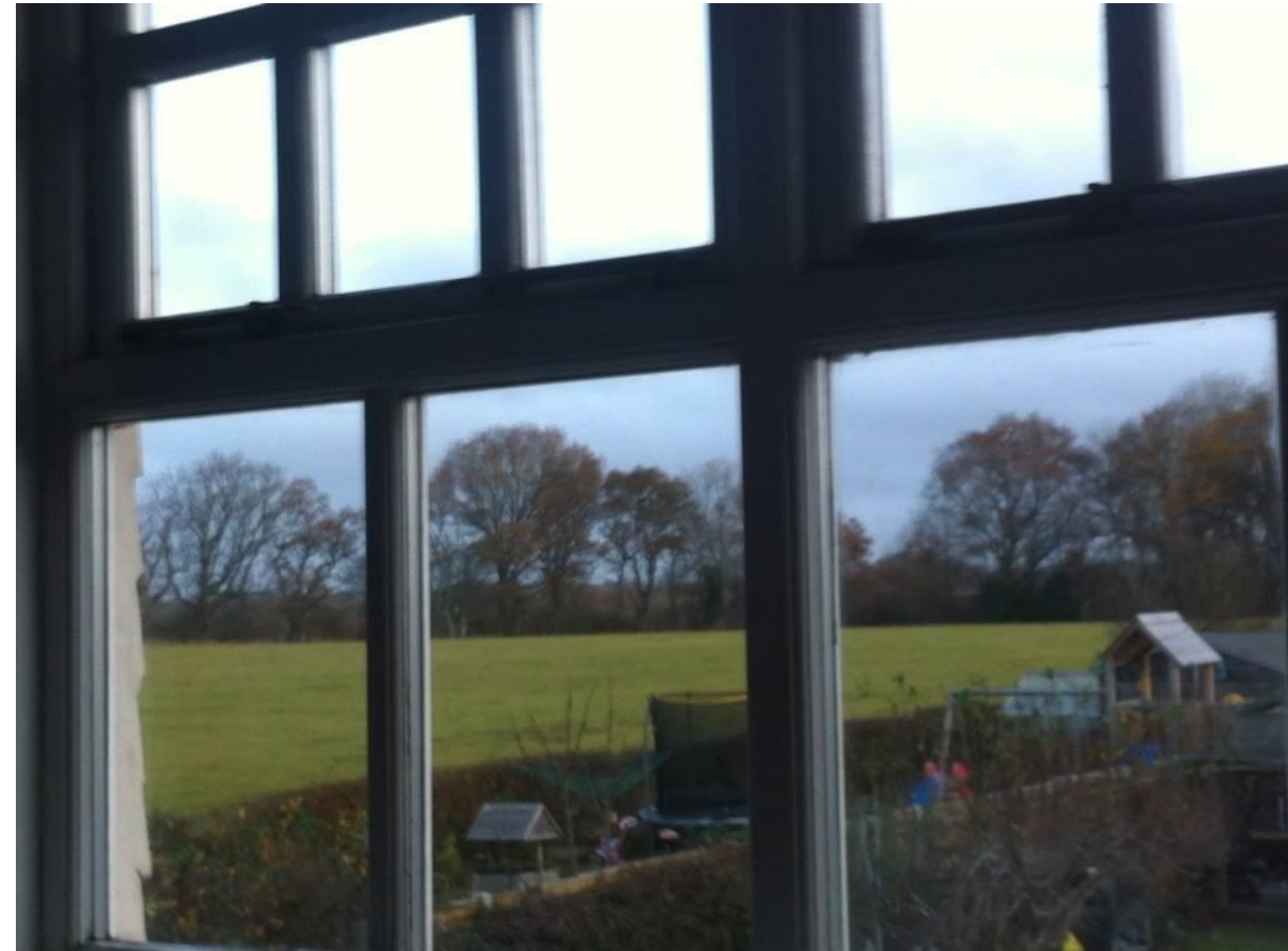
Rosemead: picture from our bedroom window before Rosemead estate was built in 2017

They key is to share the successes with local people to ward off the apathy that naturally sets in after several objection letters are sent by individuals and applications still get approved and to maintain the pressure on those in power.