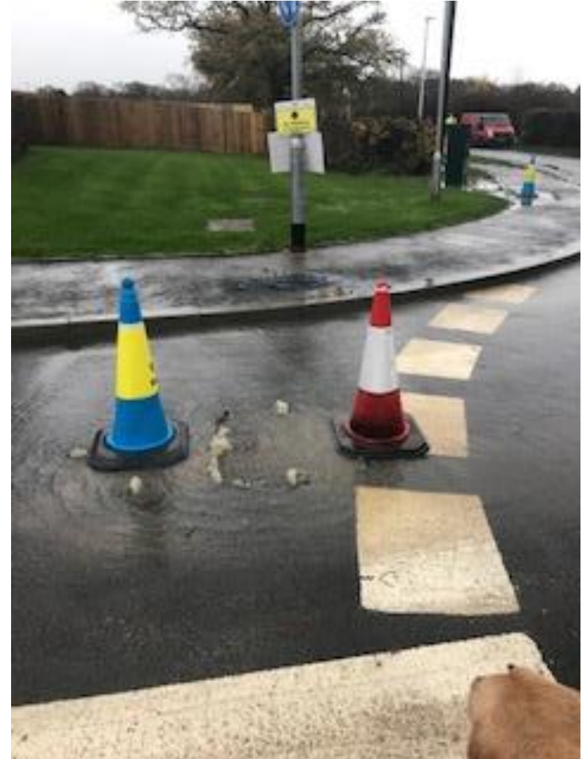
Regular flooding on Horebeech Lane after Rosemead was built

This is an extremely high rate of growth, especially for a largely rural District, even for the South-East. It can be questioned whether it is achievable, aside from whether it is desirable. Of course, the change of character of the District as a whole from such a scale of growth will inevitably be significant.