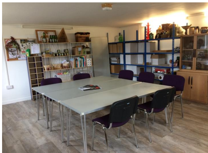
The classroom inside the restored Apple Packing Shed

COG is also in receipt of annual Environmental Stewardship payments to fund the management of traditional orchards as well as educational activities, and it receives annual income from the renting of allotments managed by Colwall Allotment Association.