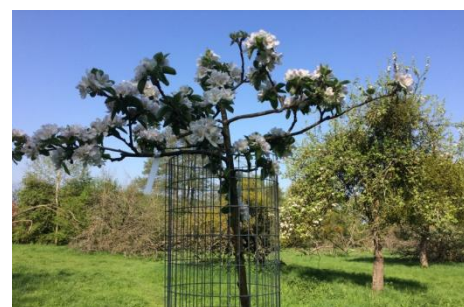
A new apple tree planted by COG in Stamps Orchard

hours that equates to 1,200 hours. The work has ranged from planting new fruit trees, coppicing, balsam and bramble bashing, harvesting, juicing, making flaming brands for Wassail, putting up gazebos for events, grafting trees, mistletoe management and fruit tree pruning. Skills and knowledge were freely shared and we also had several discovery sessions when we found out about mammal trapping, meadows and apple identification.