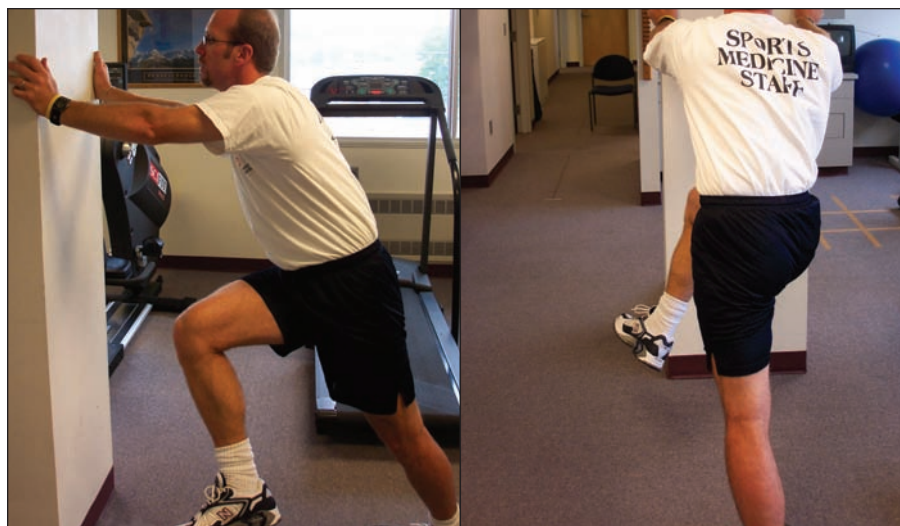
FIGURE 1. Multiplanar calf stretch with use of “tristretch.”