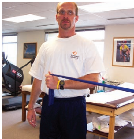
FIGURE 8. Shoulder rotator muscle strengthening.

diately after getting out of bed). Pain intensity increases with prolonged weight bearing, especially if walking barefoot or in dress shoes.