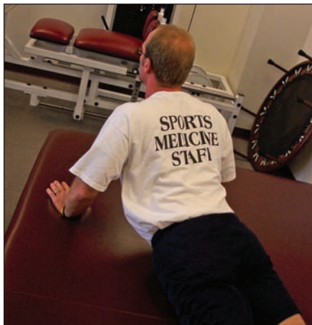
FIGURE 9. Prone-lying press up with “Mckenzie Method.”

in a semi-flexed position and move slowly rather than sit still. Discogenic pain tends to be sharp or burning and often shoots into the lower leg. Spondylolysis and spondylolsthesis patients tend to have pain into the buttocks that is worse with extension and lateral side-bending.