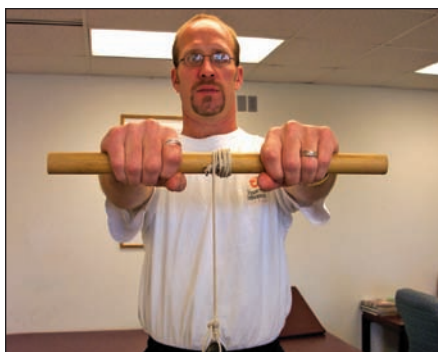
FIGURE 5. Forearm extensor strengthening.