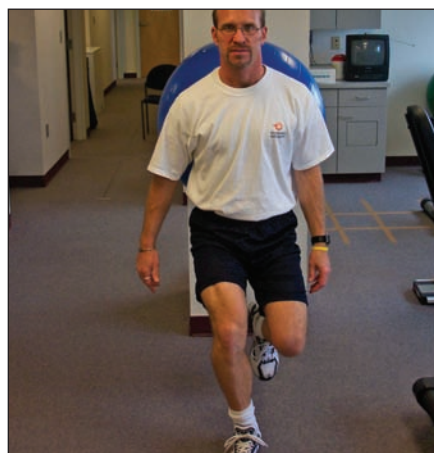
FIGURE 3. Single-leg wall squat with “thera-band ball.”

Sequential Stimulator or Transcutaneous Stimulator).