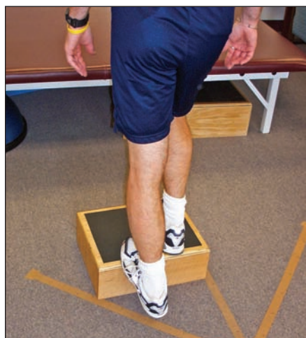
FIGURE 2. Plantar fascial stretch.