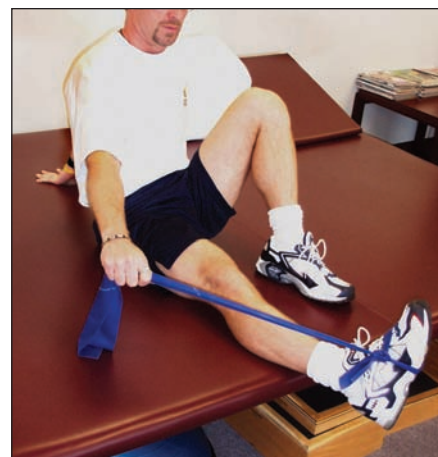
FIGURE 7. Eccentric strengthening with “theraband cords.”

Differential Diagnoses: Posterior tibialis or