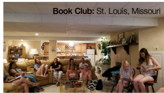
Book Club: St. Louis, Missouri