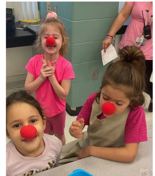
No Clowning Around