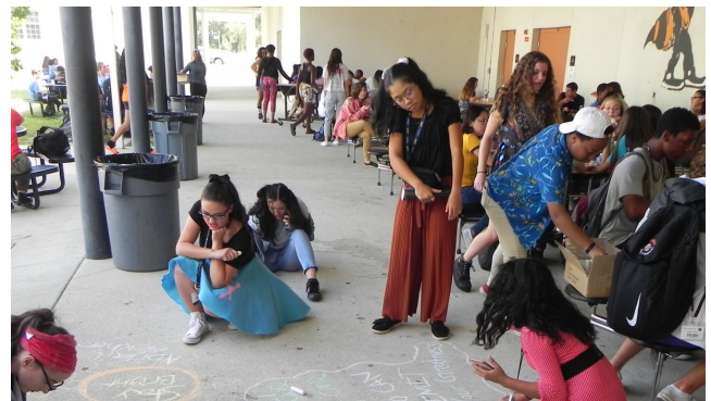
Stomp Out Bullying