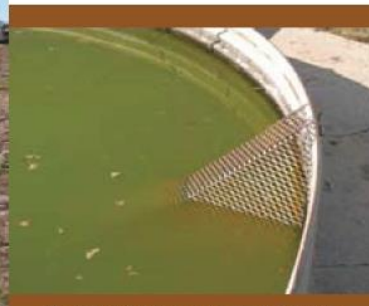
Trough with wildlife escape ramp

Water for a supplemental water feature may be obtained from a well, guzzler, or any other catchment system. Guzzlers are a cost-effective technique to provide water in areas without an existing well. Contact your TPWD biologist for more information on guzzlers