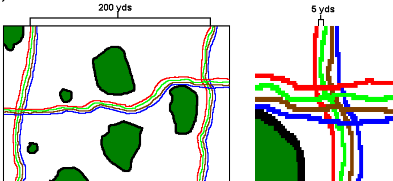
Figure 3. Space groups of disk strips at 200 yards. Space annual disk strips within each group such that there are 5 yards (15 feet) of undisturbed area between each strip. Disk each strip once every 4 years or when grasses begin to dominate. A 4-year rotation is shown above where colored lines represent disk strips.