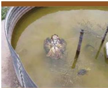
Drowned red-tailed hawk