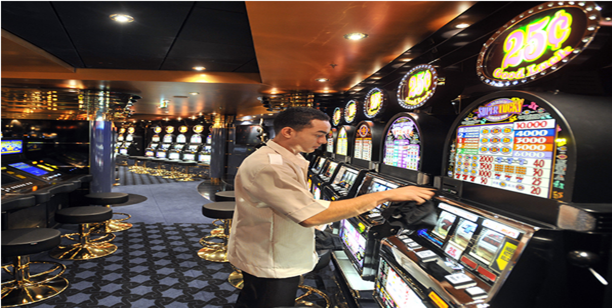
A cruise ship employee cleans a slot machine onboard MSC cruises' Magnifica in Saint-Nazaire

They might also promise a boost to the economies they frequent. But Klein says they work out deals with local vendors where they take up to 70% of the onshore revenue — and studies have shown that local populations in foreign ports don't get much out of such partnerships.