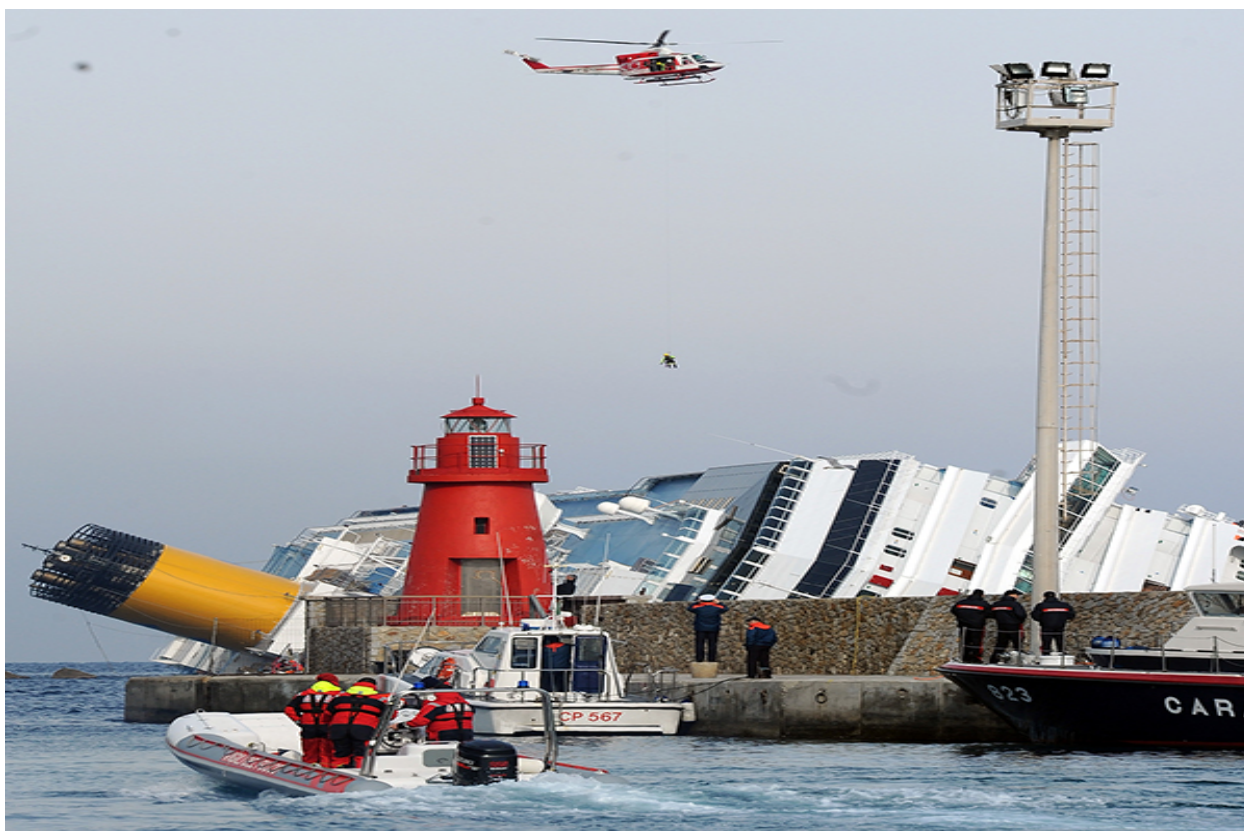
Rescue teams search for survivors on the Costa Concordia, which struck a rock off the Italian coast in 2012