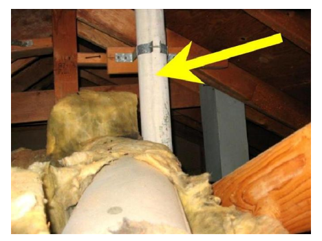
Figure 1. Possible asbestos insulation on furnace exhaust flue in attic.

Asbestos can also be found in some types of attic insulation and some types of ceiling acoustic tiles, as well as many other places depending on when the home was built. Another very common area where asbestos still exists in our homes is as insulation on exhaust flues on forced air furnaces (typically in the attic; see Figure 1) and water heaters (see Figure 2). Asbestos exhaust flue insulation, also called asbestos pipe wrap, is one of the more hazardous uses of asbestos because it is less stable than other forms of asbestos materials due to the heat from the exhaust flues. Generally it is safe to assume that insulated pipes contain some sort of asbestos pipe insulation material. Because asbestos pipe insulation is prone to deterioration, most authorities consider it a friable asbestos material and a health hazard.