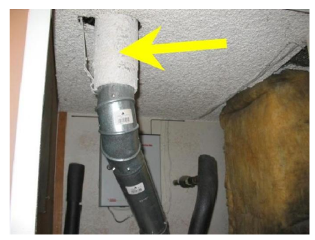
Figure 2. Possible asbestos insulation on water heater exhaust flue.

You and your family should use caution if asbestos materials are suspected, and regular homeowner monitoring and maintenance to protect suspected materials from damage or otherwise being disturbed.