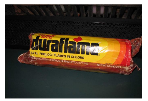
Figure 1. One of several types of manufactured wood logs.