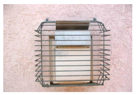
Figure 3. Wire cage installed over direct vent to protect against burns.

curious young children. Condensation sometimes forms on the glass of direct-vent fireplaces, particularly during the first few minutes of operation. According to Mr. Dale Feb, Executive Director of the Fireplace Investigation, Research, and Education Service (Moorpark, California), the white film includes sulfuric acid, produced during the combustion process. Sulfuric acid can permanently etch the glass and should be removed on a regular basis.