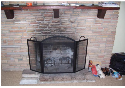
Figure 2. Soot above the fireplace can also indicate dangerous gases accumulating inside the home.