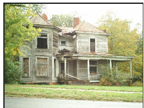
Figure 1. "Haunted houses" come about due to lack of maintenance, typically from not being lived in for extended periods of time.

If the residence has been vacant for more than a few days prior to the property inspection, there is a possibility that the testing I did during the property inspection might have actually caused some problems. For example, the most common problem caused by property inspections in vacant residences has to do with plumbing leaks. When water faucets and drain pipes are not used for a relatively long time, their rubber sealing components can dry out and harden. The first time they are used, then, such as at a property inspection, might result in damage to interior