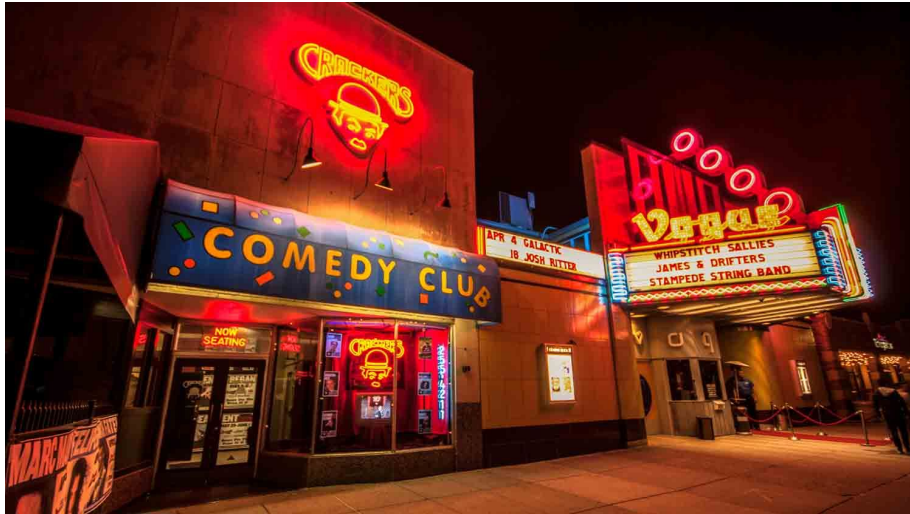
Figure 4: Image of some of the clubs and venues located in the Broad Ripple District

After a day of networking, take the time to relax and enjoy Indy's cultural and arts districts. If you and your guests are looking for a night spent on the town and want to explore Indy's urban side, be sure to check out the Broad Ripple Village District, as pictured in Figure 4. Here, you will find plenty of opportunities to engage in a lively and upbeat part of town, complete with local DJs, independent art galleries, and unique boutique shops (VisitIndy.com, n.d.).