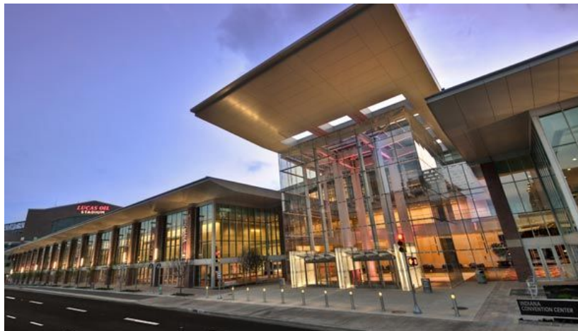
Figure 1: Photo depicting the exterior of the Indianapolis Convention Center

Located just 20 minutes away from the Indianapolis International Airport, the Indianapolis Convention Center offers 566,500 square feet of exhibit space in a convenient location. The convention center recently underwent a $245 million upgrade to enhance its modern design, as depicted by Figure 1, and is now one of the largest in the nation. It is divided into two floors with multiple halls and rooms located on each floor, allowing you to select the ideal space to host breakout sessions and ensure your guests enjoy themselves (Indianapolis Convention Center and Lucas Oil Stadium, n.d).